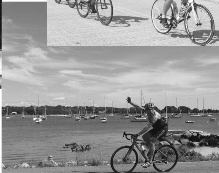
TFCE September 8, 2019