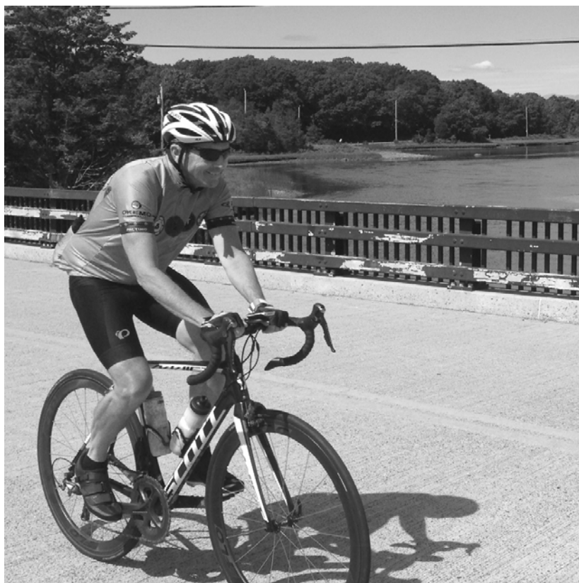
TFCE, Sep 8, 2019. Little River Bridge Your photographer (Monica) usually comes across a crowd of very tired riders stopped for a rest on Little River Bridge, but the weather this year was so perfect that all riders were speeding by, still strong and comfortable in the last 20 or so miles.