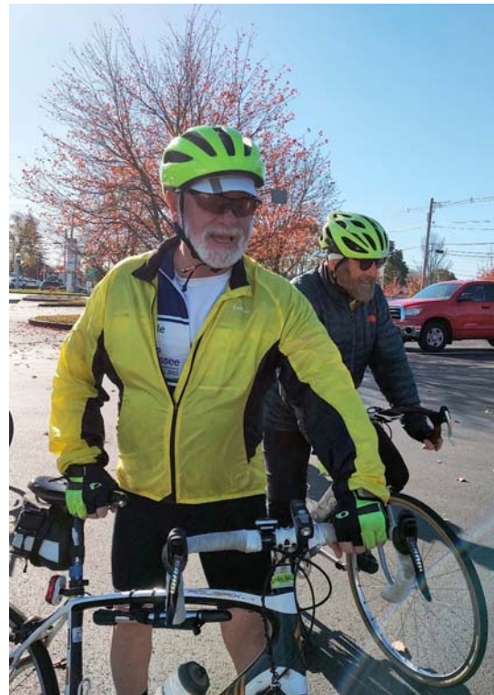
Below left: November 6, Fall River 50 start