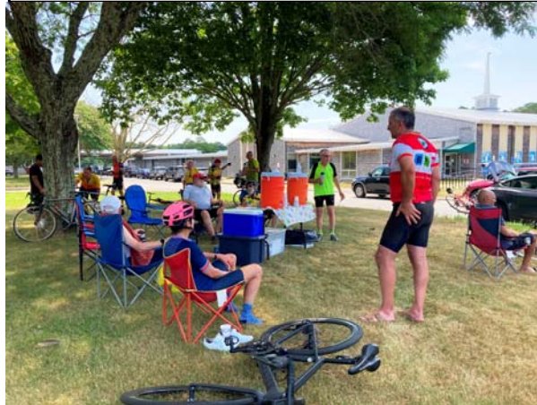
Left: Socializing after the Miles Standish Ride at our new start location.