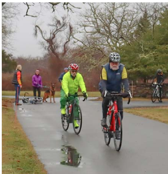
2022 New Year's Day Ride, Little Compton.