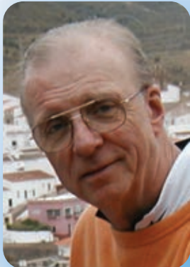
Nursing Home Administrator, cyclist, pool shark, and BFF of the Bikebus Crew